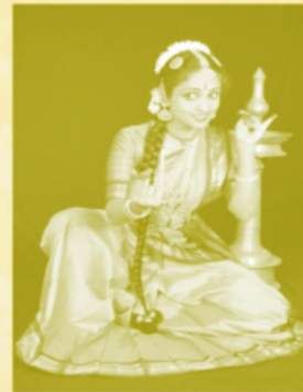
Bharatanatyam is from Tamil Nadu

What is this dance and where is it from?